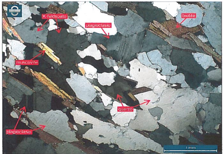
Magnification: 25x Illumination: PPL

The image shows the gneissic texture of the rock characterized by a granoblastic matrix made of subidiomorphic, prismatic crystals of K-feldspar and plagioclase, accompanied by minor quartz. Quartz is recognizable by the irregular shape, typically lobed edges, and undulose extinction. Plagioclase is characterized by frequent polysynthetic twinning. In K-feldspar crystals are sometimes visible small perthite lamellae and in some cases also simple twinning. Rock schistosity is due to the presence of mica flakes of biotite and muscovite.